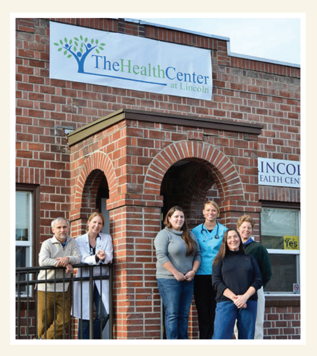
The Health Center at Lincoln High School

The success of Lincoln High has been an inspiration to other schools. THC has now opened a clinic at Blue Ridge Elementary, which has one of the city's most at-risk student populations. Blue Ridge is also home to one of three local Head Start programs adopting the <u>Head Start/Trauma Smart</u> model.